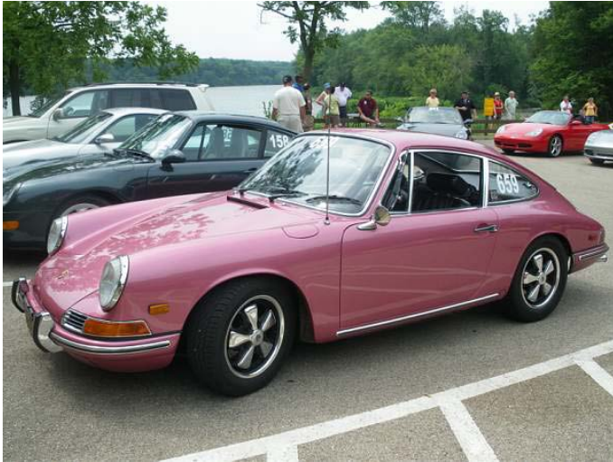
Here's your Porsche, Virginia!

The driving was great even though we passed through many road tollbooths.