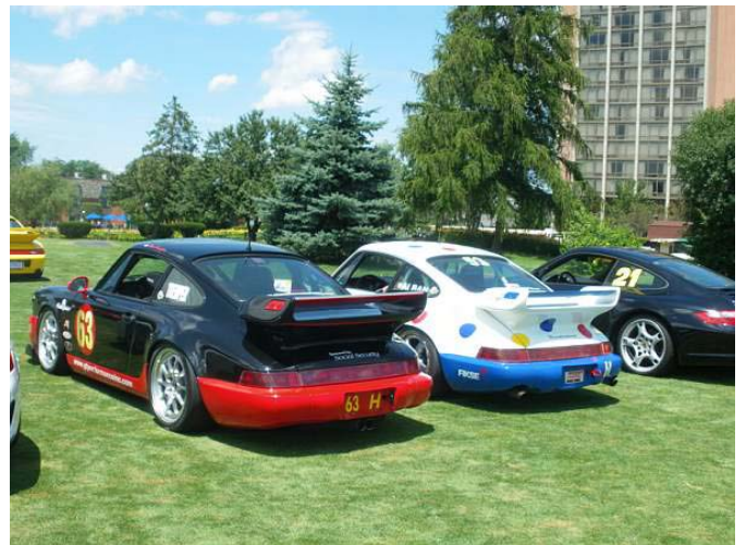
Two 911s having a whale (tail) of a time.

Next year's Porsche Parade is in Savannah, Georgia and we are excited to see this historic southern city filled with our favorite cars. See you there? VIR