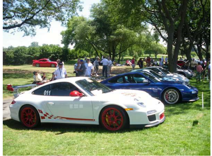
New 911GT3RS on the show field.

The driving tours such as the Route 66 and Castle Rock tours were a good way to see the Illinois countryside. The Gimmick and Technical Rallies were other great ways. A further tour featured was the Architecture River Cruise in Chicago.