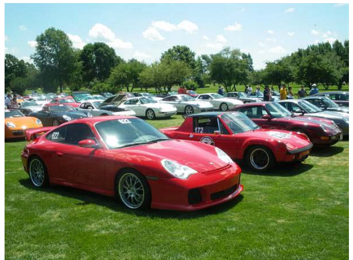
Old meets new, all are welcome!