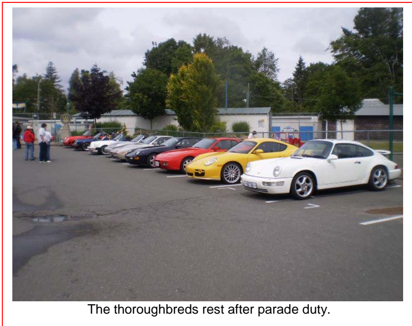
The thoroughbreds rest after parade duty.

As we waited at our marshaling point, the rain stopped. Although the sun didn't shine, it did remain dry for the entire parade. We had enlisted the help of two of my son's friends to carry the club banner. The parade lasted about 45 minutes; afterwards we had our cars on display for about an hour.