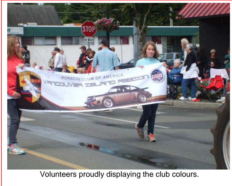
Volunteers proudly displaying the club colours.

Despite the less than perfect weather, the show must go on. We had nine cars turn out for the annual Comox Valley Canada Day Parade. This is the first year that our club has participated. I got the idea last year as I watched the parade go by. I thought what a great way to get involved with the community!